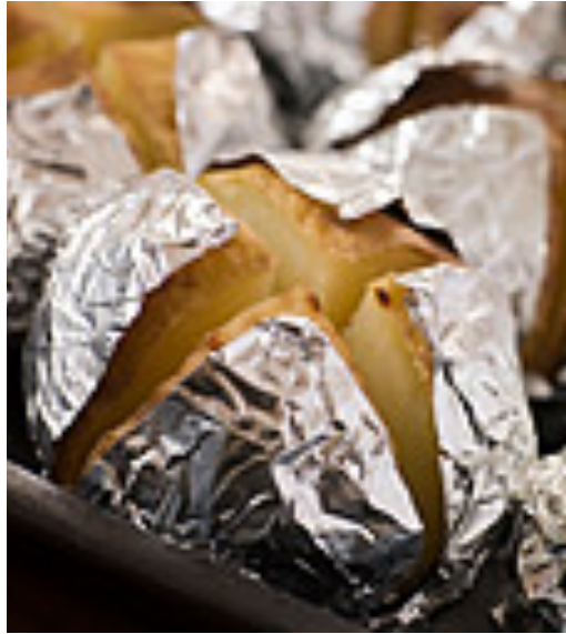
↑ Jacket potatoes